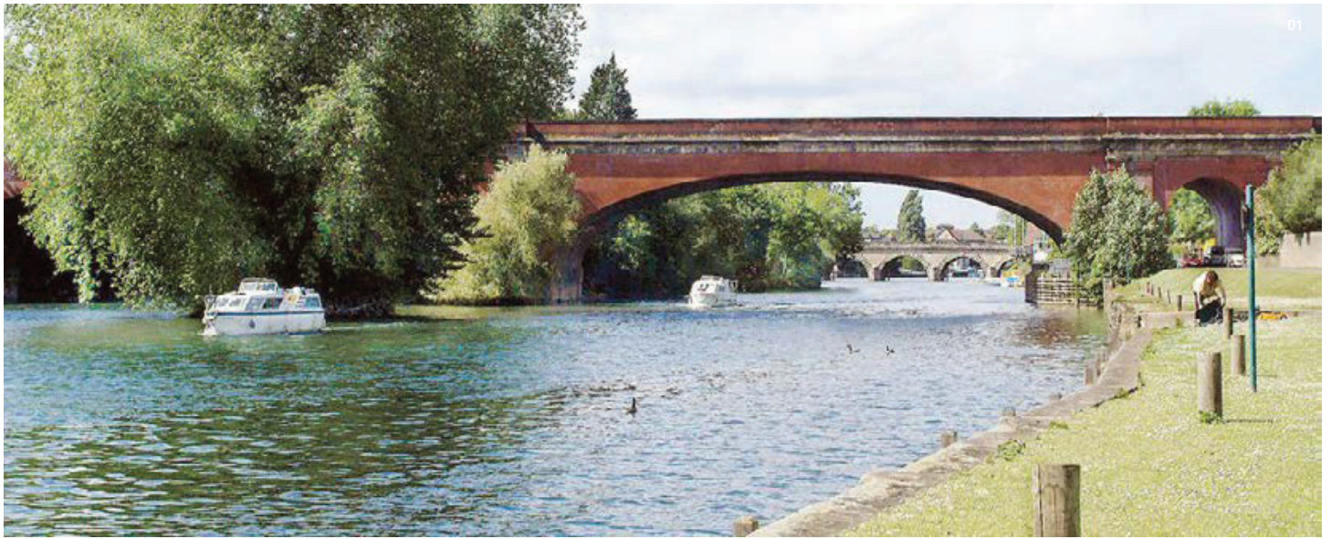
01 Brunel's Sounding Arch, Maidenhead 02 Stanley Spencer Gallery